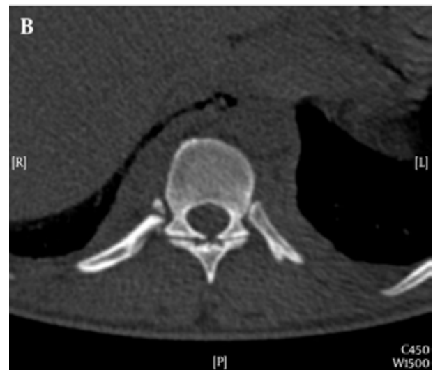
Figure 2. Computerized Tomography of Spine Showing Fracture of Head of 11th Rib and no Other Bony Injury

root leading to its avulsion and force transmission to the spinal cord and cord injury. In our case, the patient was hit by a four-wheeler from behind while he was pushing another vehicle. The displacement at the spinal column could have been prevented by the rib cage (though one of the rib heads got fractured due to the impact) but hyperextension at the thoracic spine with buckling of ligamentum flavum could have led to the injury of the spinal cord. The few reported cases in the literature of the thoracic SCIWORA were managed conservatively (9, 13). Some of the authors had included steroids as part of their treatment along with bed rest. The use of steroids is