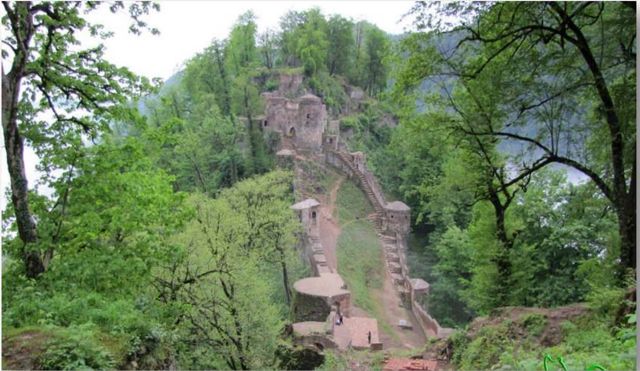
Roudkhan castel, Fuman, Guilan Province, Iran.