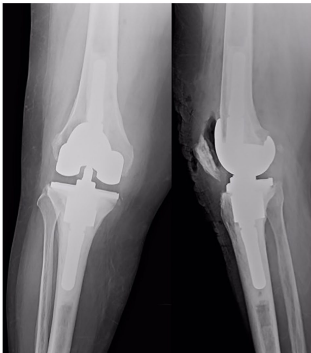
Fig. 3 Standard fixation for ‘easy-revision’ cases.

it allows a more gradual and progressive preparation of the diaphyseal canal and avoids component malposition because the surgeon can impose the reaming direction. Zone 3 (diaphyseal) fixation remains fundamental in rTKA to protect the juxta-articular bone until metaphyseal implant integration or when these zones are absent or highly compromised. Two methods of fixation may be used: fully cemented or press-fit cementless stems. The authors favour the former technique, particularly in combination with relatively short (60 mm long) stem extensions (Fig. 3), even if, in the available literature, no clear superiority of any type of stem fixation has been found. 19 Disadvantages of the use of cementless stems include a possible inferior immediate fixation, the possibility of ‘end-of-stem’ pain for diaphyseal edge loading, and distortion of proper condylar implant position in cases with anatomical deformities in either metaphyseal or diaphyseal regions. The geometrical centres of the tibial epiphysis and diaphysis are often not aligned, and linking zone 1 to zone 3 with an offset stem is required to avoid component overhang and bone uncoverage. Unfortunately, the use of offset stems in rTKA is related to an increased complexity of surgical actions and instruments. We feel that use of a relatively short cemented stem bypasses this problem and enhances fixation.