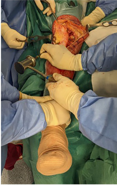
Fig. 2 Tibial component extraction.

and lateral side. It is advanced below the component's surface as much as possible until the pegs or the box area is reached. Posterior chamfer and posterior condyle are undermined with osteotomes to avoid damage to the surrounding soft tissues. In patients with a stemmed implant, an anterior femoral cortex osteotomy or a complete window may be created to allow component loosening or to remove residual cement. 15 The last step is to remove the tibial component. The inferior tibial surface is approached with the use of the reciprocating saw in a parallel direction from the anterior and posterior aspect of the tibial keel taking care of the surrounding soft tissue. Then a pointed blunt impactor is inserted through the metaphyseal tibial bone lateral to the patellar tendon to hammer the component (Fig. 2). The removal of cones or sleeves is one of the biggest challenges due to the bone ingrowth. In a modular implant, components should be disengaged firstly to expose the sleeve/cone–bone interface. This allows the disruption of the bone ingrowth into the porous metal, then a universal stem extractor can be used to remove the remaining implant.