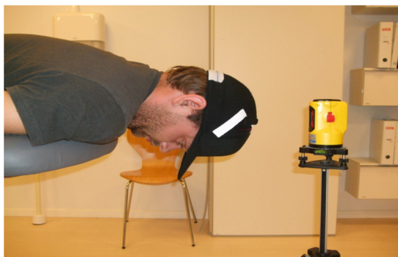
Figure 5 The neck extensor test.

Landis [69] criteria were used to interpret ICC agreement values: slight ( r = 0.00-0.19 ); fair ( r = 0.20-0.39 ); moderate ( r = 0.40-0.59 ); substantial ( r = 0.60-0.79 ); and almost perfect ( r = 0.80-1.0 ) reliability [69]. Primary data analyses were performed for the whole group due to the small sample size. Data were analysed using SPSS