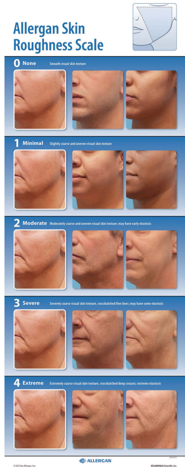
Figure 3. The Allergan Skin Roughness Scale assigns a grade from none (0) to extreme (4) that describes the severity of skin coarseness, crosshatching, and elastosis in the midface area delineated in the diagram shown in the upper right corner.

All subjects who qualified for the initial image capture events were invited to attend the live validation sessions. Subjects were instructed to arrive at the study center clean-shaven, to remove make-up and jewelry, to wear dark pants or jeans and a provided black T-shirt, to not drink alcohol excessively before the sessions, to try not to alter their usual routine (e.g., their facial care routine and normal sleep or hydration patterns) between sessions, and to not have tanning sessions or extensive sun exposure between sessions. On arrival at the study center for the first live validation session, subjects signed informed consent and were assessed for eligibility, age, sex, race (as reported by the subject), and Fitzpatrick skin type (determined by the investigator). Subjects were excluded if they had their photographs included in the scale, anything that would interfere with visual assessment of the area of interest; any treatment with toxin/fillers, dental procedures, or surgery that would alter the areas of interest within 2 weeks of the first evaluation session or plans to have one of these procedures between the 2 sessions; or diagnosis of pregnancy. 2D images of each subject were collected at the first live validation session using a 2D custom studio suite for facial imaging with Nikon