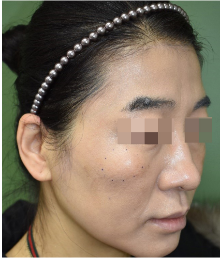
Fig. 1. Initial gross photograph of the mass. The mass was located in the right zygoma area, with a diameter of 2.2×2.1 cm.