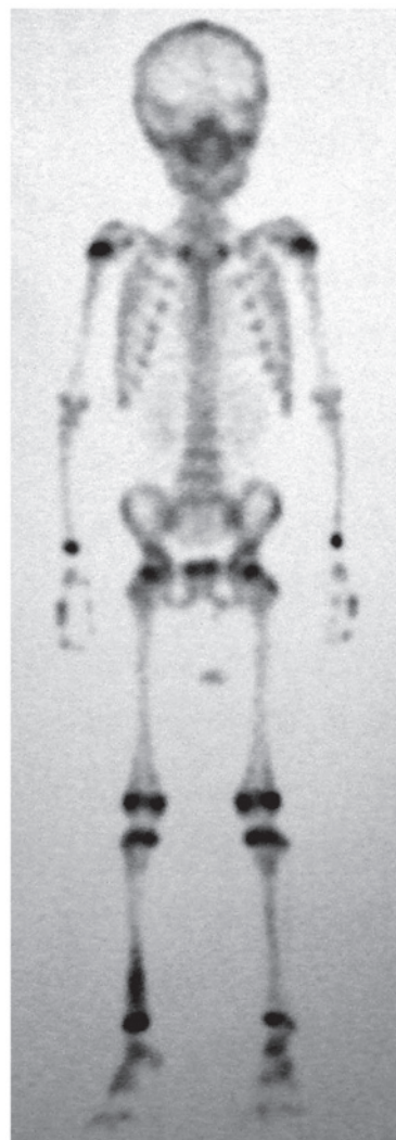
Figure 3. Technetium-99m bone scan showed focally increased uptake in the distal tibia.

The primary differential diagnosis includes other radiopaque masses, including osteoblastoma, osteoid osteoma, fibro-osseous lesions, cementoblastoma, osteosarcoma, exostosis, complex odontoma, sessile osteochondroma and end-stage osteomyelitis (13,14).