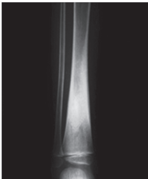
Figure 1. Anteroposterior radiography showed increased radiopaque nidus in the distal tibia.