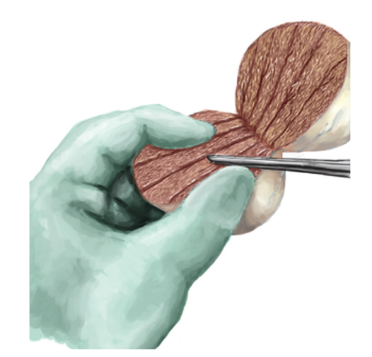
Figure 3 Bivalved testis. Wide exposure of seminiferous tubules and the centrifugal vessels running parallel to the tubules and septae. Small hemostats are used to secure the edge of the cut tunica and seminiferous tubules together, limiting the risk of separation during the procedure and facilitating exposure and dissection.

Figure 2 Open testicular biopsy. After the testicle is delivered and inspected, the tunica albuginea is incised about 5 mm transversely with a No. 11 blade scalpel avoiding any blood vessels, then gently squeezing the testicle and the protruding seminiferous tubules are excised using iris scissors.