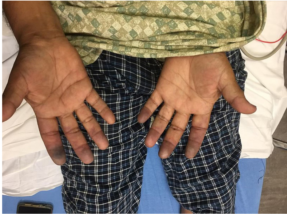
FIGURE 1: Cyanosed fingertips on the day of admission