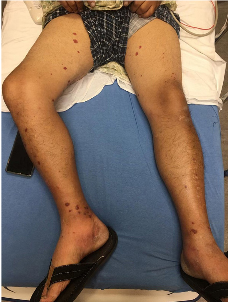
FIGURE 4: Purpura on bilateral lower extremities

For GPA, he was initiated on methylprednisolone and rituximab. Initial therapeutic regimens for RP included aspirin, nifedipine, topical nitroglycerin, and sildenafil. However, due to his progressive symptoms of active RP, the patient also required a digital nerve block of three ischemic digits along with the escalation of therapy with bosentan and epoprostenol. Despite timely therapy, the patient's finger ischemia worsened, and he developed dry gangrene in three fingers. After 12 days of remission induction treatment, his symptoms of purpura and digital cyanosis improved in the remaining fingers. The patient underwent an interval amputation of three digits (Figure 5). He was sent home on remission maintenance therapy with methotrexate for GPA and nifedipine, sildenafil along with bosentan for RP.