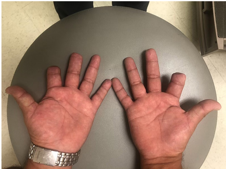
FIGURE 5: Post amputation of gangrenous digits left and right