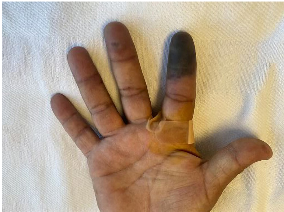
FIGURE 2: Progressive worsening of ischemia of right index finger