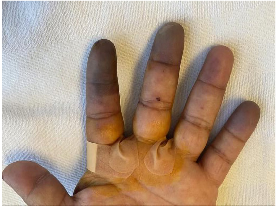
FIGURE 3: Progressive worsening of ischemia/active Raynaud's phenomenon of left index, middle, and little fingertips