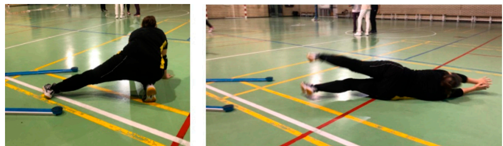
Figure 3. Specific defensive goalball movement from low position with the acoustic stimulus.

The second test consisted of a complex reaction test, where athletes performed a specific defensive goalball movement from low position with the acoustic stimulus (Figure 3). Two training attempts and three experimental tests were carried out, with one minute of rest between tests.