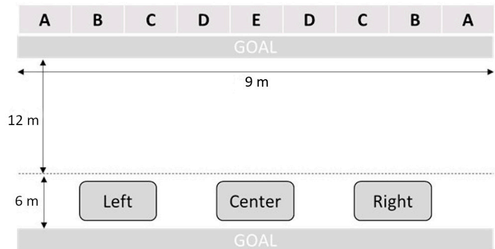
Figure 1. Throwing site (Left, Center, Right) and target areas (A, B, C, D, E) for accuracy test.

the arm and throwing technique that each player preferred. The goal was divided in nine zones or target areas (1 m per zone), with visual marks in the floor for the researchers (Figure 1). Zones A, C, and D were registered as the places with the highest goal probability, based on previous research [4]. In this way, goals in zones A–C–D were quantified with 2 points, whereas goals in zones B–E were quantified with 1 point. Throws out of goal zones were not quantified (0 points). The global punctuation was the sum of the points in the 9 throwing attempts.