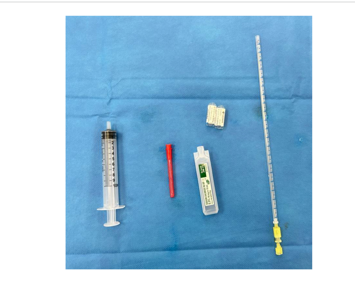
FIGURE 2 | Equipment required for preparing hyaluronidase (left to right)-10 cc syringe, blunt drawing needle, normal saline, hyaluronidase, and spinal needle.

had infiltrated the rectal wall. This had quickly dissolved within 48 h. If the patient had been symptomatic with severe pain, this would have resulted in rapid resolution of his symptoms. In addition, it would have averted potentially prolonged clinical symptoms as it may take 1 year for HA to resolve naturally. This procedure also allowed us to reschedule the start of the patient's IMRT with minimal delay.