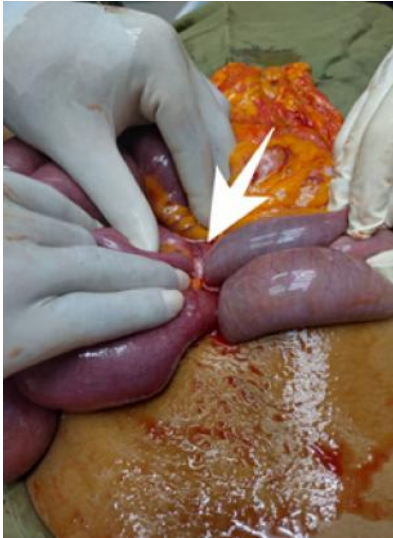
Figure 2: Intraoperative picture showing the band over the ileum (white arrow)