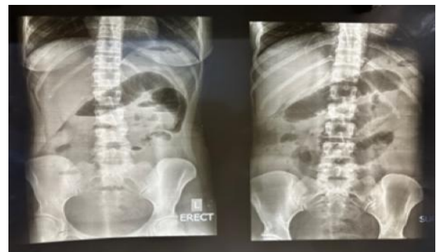
Figure 1: Preoperative X-ray showing multiple air-fluid levels and dilated bowel loops

A diagnosis of intestinal obstruction from small bowel volvulus was made. She was optimized for surgery, commenced on broad-spectrum antibiotics, fluids and was placed on Nil per Os (NPO) in preparation for exploratory laparotomy. The plain abdominal X-rays showed multiple air-fluid levels with dilated proximal bowel and relative gaslessness in the pelvis (Figure 1).