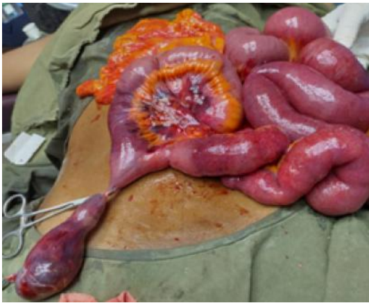
Figure 3: shows the Meckel's diverticulum on the antimesenteric border of the ileum (clamped at the base)

On the second postoperative day, she was commenced on a clear fluid diet and this was graduated to a normal diet. The postoperative period was uneventful and she was discharged on the 5 th postoperative day.