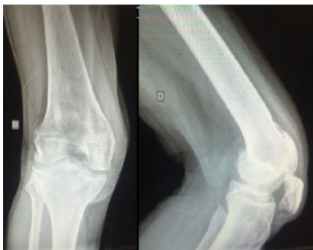
Fig. 2 Initial radiographs of the right knee.

Anteroposterior and lateral radiographs of the right knee showed a low patella, with the articular surface in contact with the intercondylar space of the femur, suggesting an intraarticular dislocation with an articular to distal/inferior face (►Fig. 2). As a complementary investigation, a computed tomography was performed with 3D bone and soft-tissue reconstruction that did not show fractures, and initially