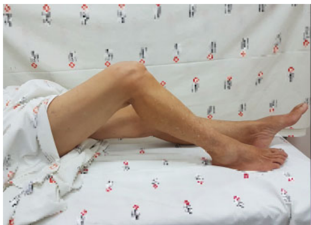
Fig. 1 Clinical examination of admission.