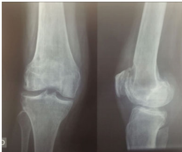
Fig. 4 Post-reduction control radiographs.

corticosteroids, which are associated with weakening or rupture of the quadriceps, are also more susceptible to this pathology. 1