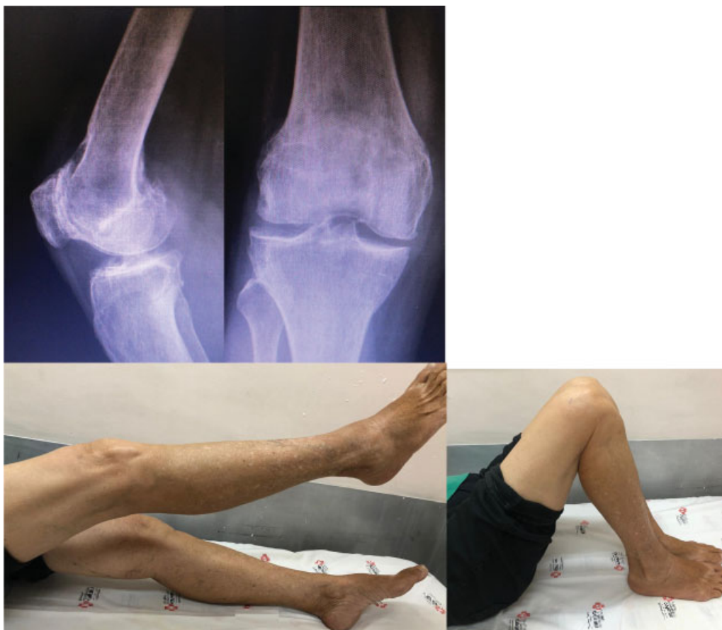
Fig. 5 Control radiographs and range of motion after 2 years of evolution.

outcome may not be as favorable, requiring outpatient follow-up for a longer time, in cases of conservative treatment. 7