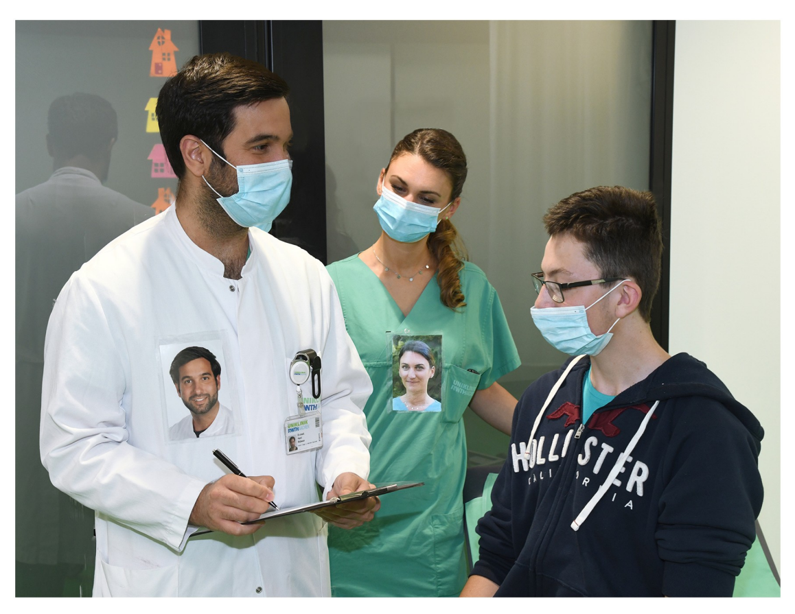
Fig 1. Portrait photos were placed in transparent self-adhesive sleeves and affixed to the work clothes of all staff, positioned at the chest for good visibility.

https://doi.org/10.1371/journal.pone.0251445.g001