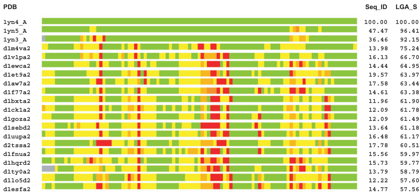
Figure 1. Structure similarities between EAP domains from S. aureus (PDB: 1yn3, 4 and 5) and 17 protein domains from the SCOP superfamily comprising superantigen toxins. All proteins were compared to the structure of EapH1 (1yn4_A), which serves as a frame of reference. Colored bars represent Calpha-Calpha distance deviation between 1yn4_A [99 residues; from the left (N-terminal) to the right (C-terminal)] superimposed with 20 structures from PDB (first bar represents a 1yn4_A–1yn4_A self-comparison). Colors represent distances between aligned residues and range from green (below 2 Å) to red (above 6 Å). The columns at the right contain information about the level of sequence identity ( Seq_ID ) and structure similarity ( LGA_S ).

In general, all EAP domains have a high level of overall structure similarity ( LGA_S over 60%) to most of the other analyzed structures, whereas the level of sequence identity is very low (below 20%). In Figure 1, we show