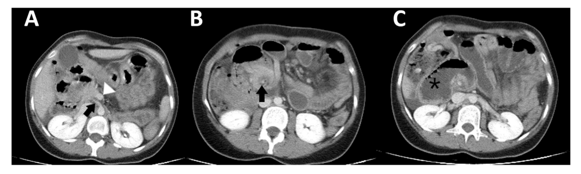
Fig. 1. Axial contrast-enhanced CT images of the upper abdomen. (A) Superior mesenteric artery (black arrow) is abnormally located to the right of the superior mesenteric vein (white arrowhead). (B) Abnormally positioned small bowel around the SMA (black arrow) with a characteristic swirling pattern, consistent with midgut volvulus. (C) Small bowel dilatation (asterisk) secondary to small bowel obstruction due to midgut volvulus.

H. Dehaini et al. / International Journal of Surgery Case Reports 73 (2020) 27-30