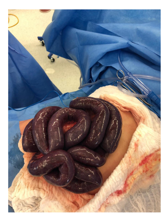
Fig. 2. Laparotomy showing ischemic bowels.

years prior to presentation and was responsive to analgesics. The patient was not taking medications nor using illicit drugs.