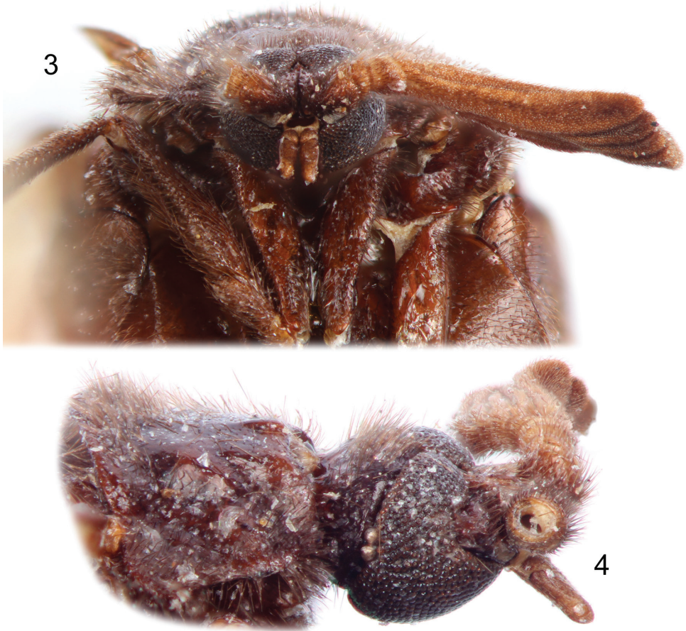
Figures 3–4. Photographs of holotype male of Rhipidocyrtus muiri Falin & Engel, gen. et sp. n. from Borneo. 3 Facial view 4 Right lateral view of head and prothorax.

longitudinal constrictions. Anterolateral lobes obliquely convex and themselves separated from obliquely convex posterolateral lobes by wide, deep and relatively setose impressions (Fig. 5). Metascutellum clearly delineated by a pair of oblique, deeply impressed sulci curved basally (Figs 5, 6), nearly linear anteriorly, converging to a single impressed medial sulcus terminating at apparent anterior metanotal margin (Fig. 5). Posterior margin of metascutellum straight in dorsal view (Fig. 5), gently convex dorsoventrally; metascutellar disc gently convex (Fig. 6) with a weak, rounded carina originating at apex, continuing approximately 1/3 length of metascutellum (Fig. 5), gradually becoming obsolete. Metapostscutellum a relatively narrow band positioned more or less dorso-ventrally, ventral and slightly anterior to posterior margin of metascutellum (Fig. 6), posterior margin of metapostscutellum strongly deflected dorsally (Figs 1, 6). Surface of metapostscutellum glabrous, impunctate except posterior-facing aspect of posterior marginal flange appearing setose due to superimposed abdominal tergite I.