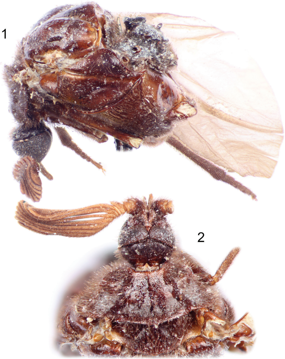
Figures 1–2. Photographs of holotype male of Rhipidocyrtus muiri Falin & Engel, gen. et sp. n. from Borneo. 1 Lateral habitus as preserved 2 Dorsal detail of head and thorax as preserved.

Head subspherical (Figs 2, 4), slightly compressed dorso-ventrally (Fig. 3). Vertex weakly convex (Fig. 4), sloping uniformly to occiput, integument shining with indistinct punctation and weak, irregular, sculpturing. Dorsal and ventral aspects of head with suberect to erect setae. Compound eyes large (Figs 3, 4), coarsely faceted,