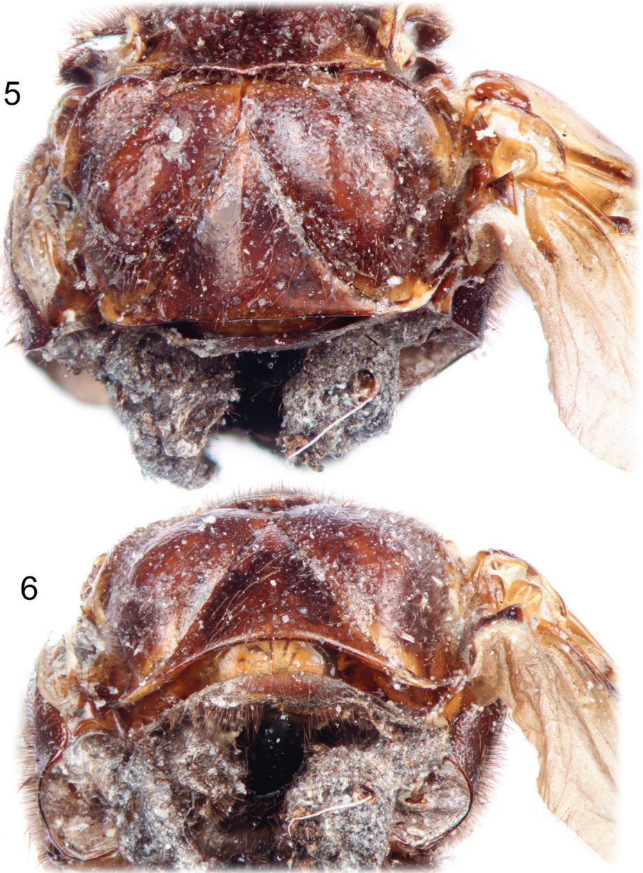
Figures 5–6. Photographs of holotype male of Rhipidocyrtus muiri Falin & Engel, gen. et sp. n. from Borneo. 5 Dorsal detail of metathorax. 6 Posterior view of thorax as preserved.

Lateral and ventral aspects of pterothorax typical of tribe, if slightly exaggerated in form; vestiture and texture similar to notum, setae more or less uniform, suberect; punctuation variable, generally scattered and weak to nearly obsolete except as noted.