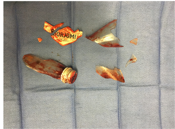
Fig. 2. Multiple shards of glass bottle removed from the distal sigmoid and rectum.

Post-operatively, the patient was monitored in the Surgical Intensive Care Unit (SICU) and was recovering well. On post-op day seven, large volume rectal and mucus fistula bleeding was noted in conjunction with severe hypotension, tachycardia, change in mental status and a drop in hemoglobin to 5.8. Rapid transfusion protocol was activated with administration of two units of packed red blood cells (PRBCs) and an appropriate response to a hemoglobin of 8.5 was observed. CT-angiogram displayed a hyperemic rectum with pericolonic inflammatory changes consistent with proctitis, without evidence of active contrast extravasation. Repeat episodes of high volume bloody rectal evacuations continued to occur over the following 12 hours, resulting in resuscitation with three additional units of PRBCs and two units of fresh frozen plasma (FFP).