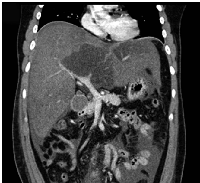
Figure 1. Abdominal computed tomography at admission showing hepatomegaly.

The patient was immediately hospitalized after diagnosed with SAH and was completely abstinent from alcohol during the hospitalization period. The initial risk score evaluated with the Maddrey discriminant function was 42.8. The patient was started on 40 mg/day prednisolone on the first day. After 7 days of corticosteroid use, evaluation for steroid response using the Lille model showed a score of 0.24, indicating continued corticosteroid treatment. After 28 days of corticosteroid use, the serum bilirubin level was 15.12 mg/dL. Corticosteroid treatment was continued, with gradual dose tapering for another 20 days. No additional stress dose of corticosteroid was administered during the treatment course.