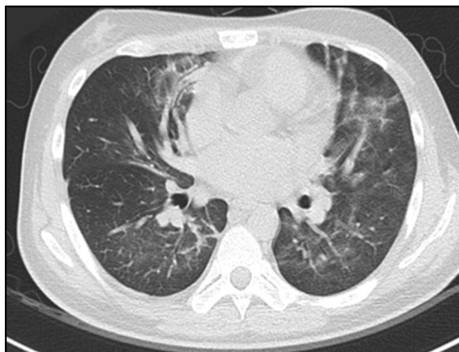
Figure 3. Thoracic computed tomography after 48 days of steroid use.

The total bilirubin level after 32 days of treatment was 13.66 mg/dL. Thoracic CT showed no sign of infection (Figure 2). After 48 days of treatment, the patient showed sudden symptoms of infection: fever reaching 38.0°C and dyspnea. Repeat thoracic CT showed atypical pneumonia, and a sputum polymerase chain reaction panel identified Pneumocystis jirovecii (Figure 3). At the time of infection, the patient was on 10 mg/d of prednisolone, which was immediately stopped and trimethoprim-sulfamethoxazole 4,800 mg/d was started. Despite the antibiotic use, fever persisted and hypoxemia developed, so IVIG was administered according to the sepsis protocol (500 mg/kg daily for 3 days). Soon after the IVIG treatment, signs of systemic infection alleviated within 2–3 days. Interestingly, the total bilirubin level, which was 14.37 mg/dL on the first day of IVIG, decreased to 8.20 mg/dL. The patient recovered from pneumonia, and prednisolone was resumed 21 days after its cessation and used for 9 more days. The patient was discharged without continuing oral corticosteroid. In an outpatient follow-up performed 11 weeks after discharge, the patient showed steady recovery. Laboratory results were as follows: total bilirubin 2.53 mg/dL and direct bilirubin 1.19 mg/dL, gamma-glutamyl transferase 174 U/L, and prothrombin time in international normalized ratio of 1.23. The summary of patient progress after admission is shown in Figure 4.