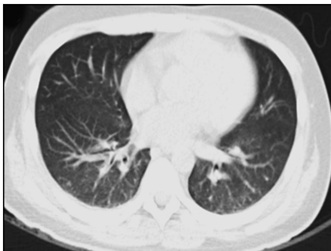
Figure 2. Thoracic computed tomography after 32 days of steroid use.

The patient was immediately hospitalized after diagnosed with SAH and was completely abstinent from alcohol during the hospitalization period. The initial risk score evaluated with the Maddrey discriminant function was 42.8. The patient was started on 40 mg/day prednisolone on the first day. After 7 days of corticosteroid use, evaluation for steroid response using the Lille model showed a score of 0.24, indicating continued corticosteroid treatment. After 28 days of corticosteroid use, the serum bilirubin level was 15.12 mg/dL. Corticosteroid treatment was continued, with gradual dose tapering for another 20 days. No additional stress dose of corticosteroid was administered during the treatment course.