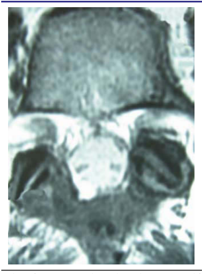
Axial view of a preoperative MRI showing changes due to a prior L5–S1 left hemilaminectomy with some degree of left facet degeneration.