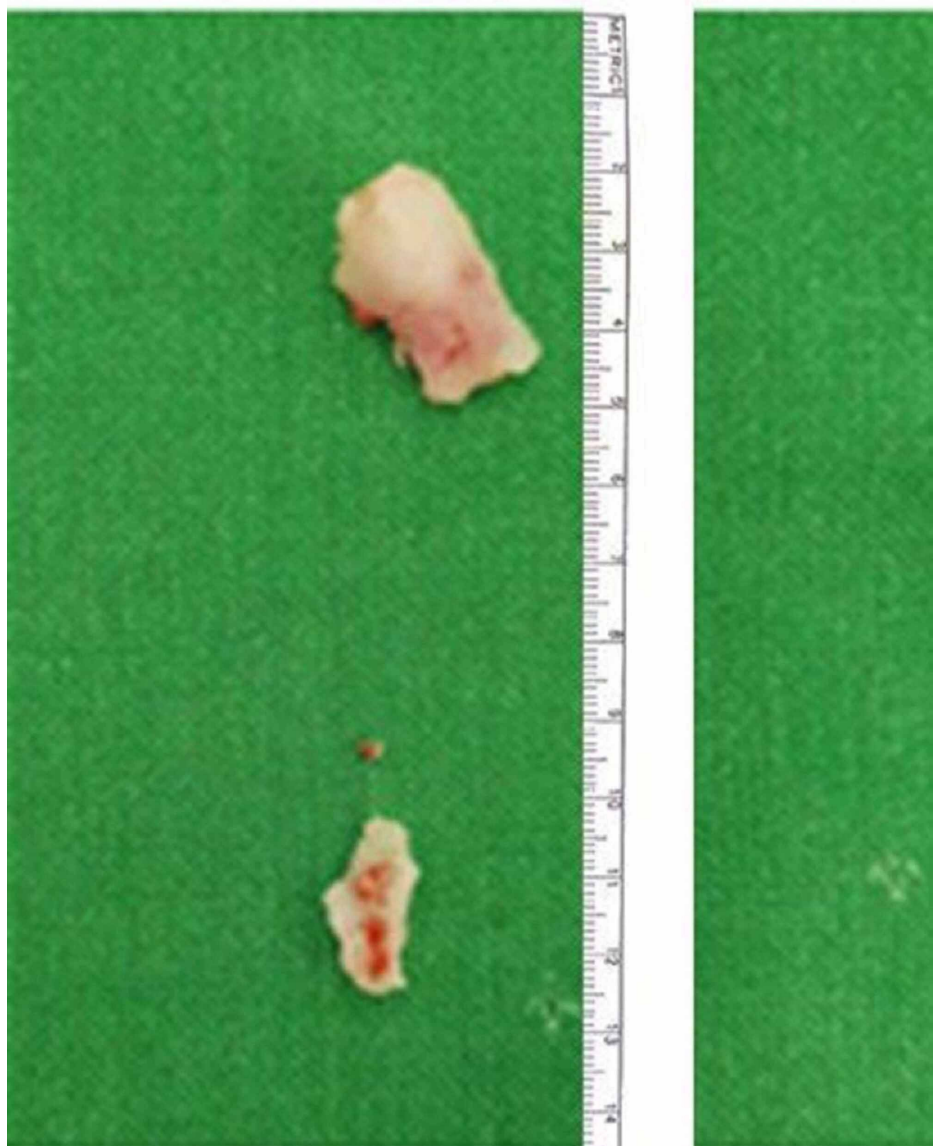
FIGURE 3: Rubber tube pieces after extraction.

Our patient underwent non-contrast-enhanced computerized tomography (Figure 1). Currently a contrast enhanced imaging is advisable for patients requiring intervention for renal stone [6]. We supplemented non-contrast-enhanced CT with per-operative retrograde pyelography to plan endoscopic access and define intrarenal anatomy. As stone formation in this young patient was most likely secondary to foreign body formation we have not performed 24-hour urine studies. However, she had basic biochemistry including serum creatinine, electrolytes, uric acid, calcium; besides urinalysis and culture which were unremarkable.