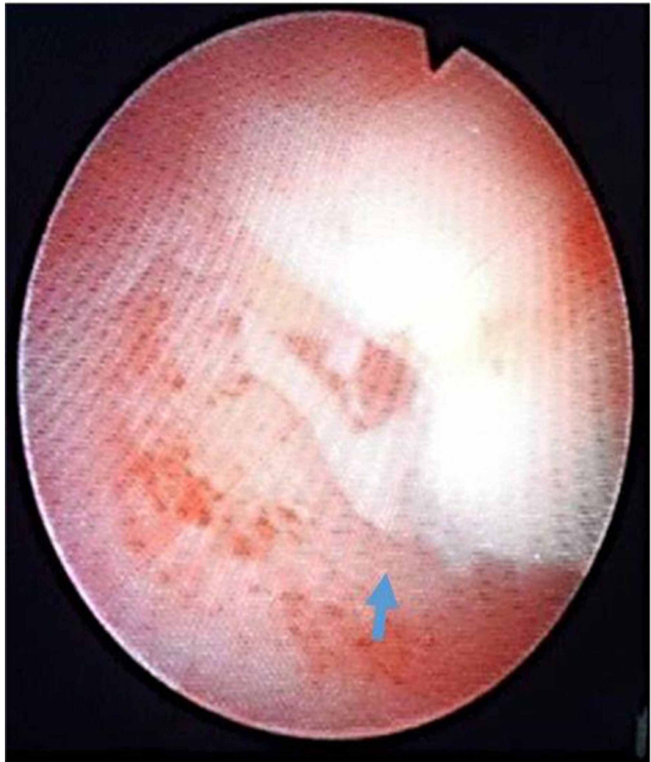
FIGURE 2: Endoscopic view of foreign body embedded in the mucosa of lower pole calyx (blue arrow)

After an extensive search and fluoroscopic guidance, a foreign body was found embedded in the mucosa of the lower pole calyx. This was approximately 1.5cm in size and removed with forceps in pieces with great difficulty. Percutaneous nephrostomy tube (PCN) was placed at the end of the procedure. On careful inspection of the foreign body, it turned out to be a piece of rubber tubing similar to abdominal drains. It was postulated to be a broken drain piece left during previous pyelolithotomy (Figure 3).