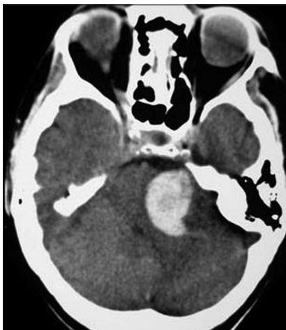
Figure 1: CT scans reveal an hyperintense lesion occupying the CPA cistern with compression of adjacent parenchyma

The patient underwent surgical removal of the lesion performed by a suboccipital approach. Macroscopically, the tumor appeared as a soft, grayish mass surrounded by multiple clots. Histological examination confirmed diagnosis of VN type Antoni A. The patient's neurological status improved gradually with mild persistence of VII and VIII cranial nerve deficits.