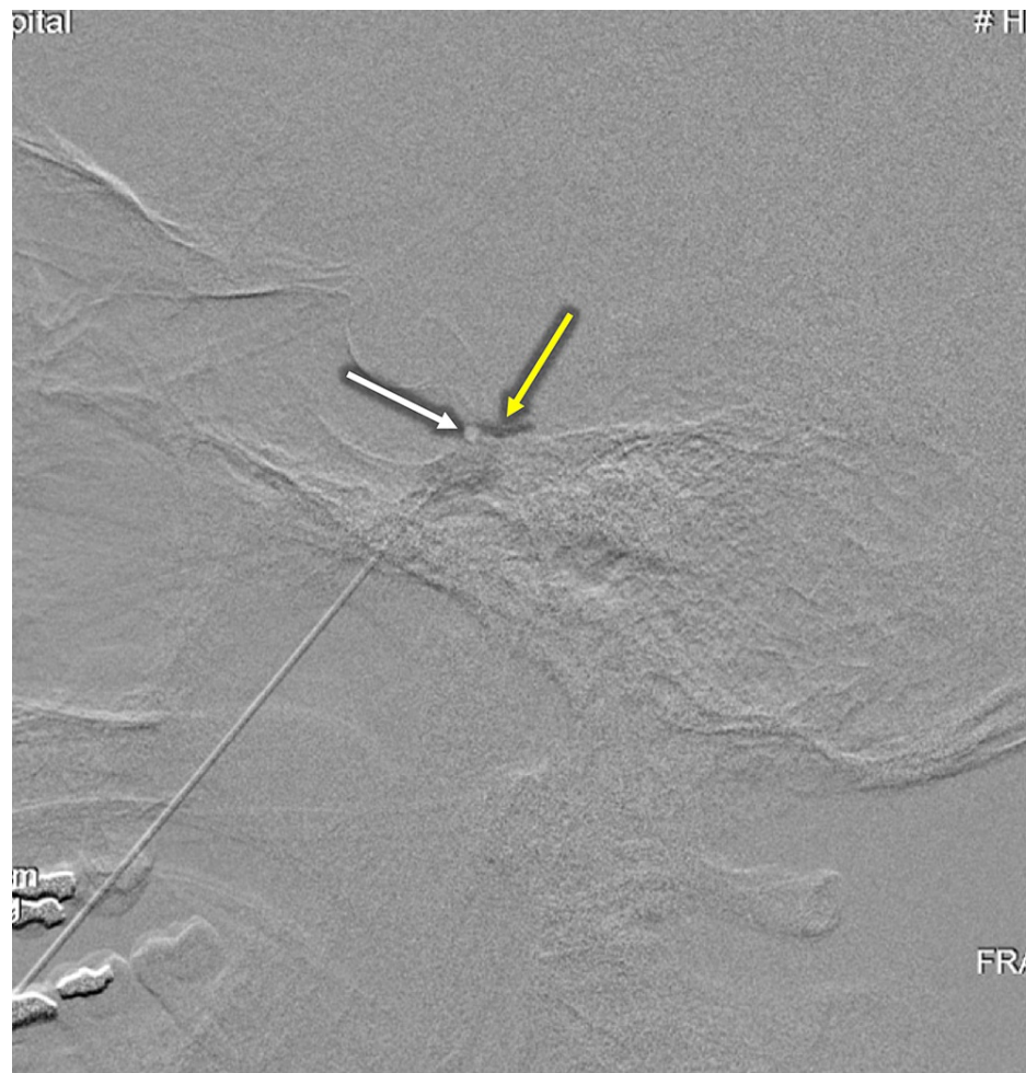
FIGURE 3: Digital subtraction CT for needle confirmation

Contrast injection used to identify needle tip placement (white arrow) within opacified Meckel's cave (yellow arrow).