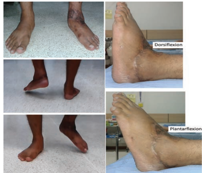
Figure 3. Standing and walking appearance included ankle dorsiflexion/plantarflexion around three months after an implantation of a prosthesis in a left ankle.

they recommend the use of a total talar implant instead. 17 The results of both studies are still controversial. Moreover, both previous studies 16,17 used American Orthopedic Foot and Ankle Society (AOFAS) ankle/hindfoot scoring system, 18 which was inadequately validated scoring system. 19 The comparisons between the results in previous studies and the current study were summarized in Table 1. The patient with an anatomic metallic prosthesis in the current study achieved improvement in functional outcomes and quality of life, and regained significant ankle and subtalar motions in the short-term period after the operation. Additional follow-up over a longer period is needed to determine the medium- to long-term results of anatomic TPR. Based on these results, the author believes that anatomic TPR may be used to replace the entire talus after traumatic total talar loss or severe crush injury of the talus, thus maintaining the clinical