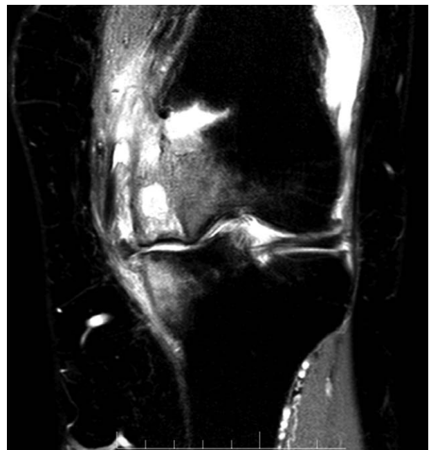
Fig. 4. Coronal Short-T1 Inversion Recovery (STIR) sequence demonstrating severe surrounding marrow edema involving greater than two-thirds the area of the MFC, and the area where the graft was harvested.

based on the fact that most affected patients are elderly, potentially osteoporotic women. They found that osteoporosis and osteopenia are commonly found in patients with osteonecrosis of the knee. They also found that two-thirds of their patients were overweight or obese, suggesting that