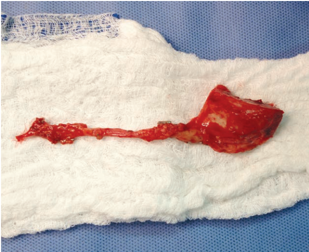
Fig. 1. The corticocancellous MFC graft harvested with its vascular pedicle.