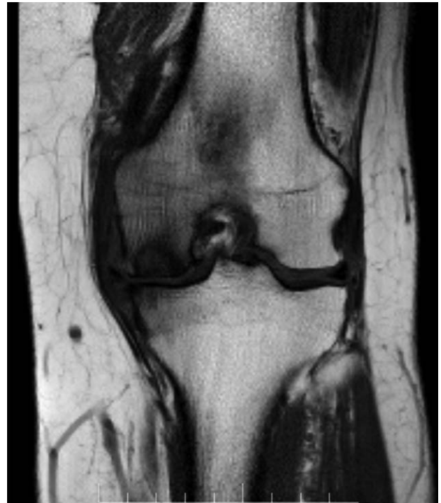
Fig. 3. Coronal T1-weighted magnetic resonance imaging sequence demonstrating a focal subchondral T1 hypointense abnormality with a band of lower intensity.

Although osteonecrosis was thought to occur secondary to ischemia, there is evidence that it may be due to subchondral insufficiency fractures. Zanetti et al. 10 in a prospective study aimed to investigate the association between osteonecrosis and reduced bone mineral density