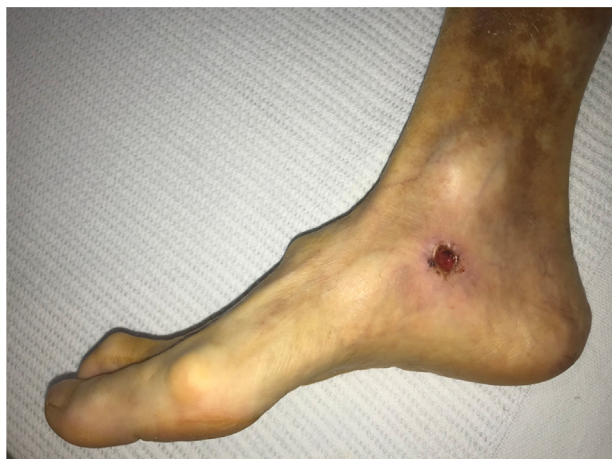
Fig 1. Nonhealing ulcer deep to the dorsal tendons of the foot.

therapy, and regular exercise. However, she now had critical limb ischemia with tissue loss and ultrasound evidence that her PAD had progressed. There was no evidence of an acute inflammatory flare of her GCA and therefore no role for more aggressive immunosuppression.