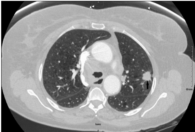
Figure 1. Chest computed tomography scan with contrast showing a left upper lobe spiculated nodule (arrow), which is consistent with primary lung cancer.

(Figure 2). The esophagus and duodenum were normal. Biopsy of the nodules revealed poorly differentiated tumor cells with a similar morphological and immunohistochemical profile to the tumor from the tracheal biopsy, therefore consistent with metastatic deposits from her poorly differentiated lung adenocarcinoma (Figure 3). The patient was stabilized, but due to her overall clinical situation and cancer history, she opted for hospice care. She succumbed to progressive disease approximately 2 weeks later.