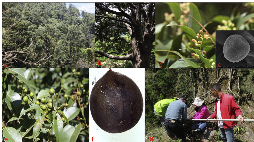
Fig. 1. Biological characteristic and field investigation of Cinnamomum chago populations. a. habitat; b. Plant morphological; c. flowers; d. pollen; e. fruit; f. seed; g. field work.

Our field survey revealed that distribution of C. chago is restricted to the Lacang River upstream of the tributary mountains in Yunlong County, Yunnan. These remaining populations not only have a limited geographical reach but are fragmented and highly isolated. It is well known that habitat is essential for the long-term persistence and survival of endemic and rare species (Kalliovirta et al., 2006; Shen et al., 2009). Importantly, our field surveys revealed that all the populations of C. chago occur in unprotected areas outside of nature reserves and are frequently affected by human interference. The survival status of C. chago is similar to other critically endangered plants such as Euryodendron excelsum (Shen et al., 2009) and Manglietiastrum sinicum (Tian et al., 2002;