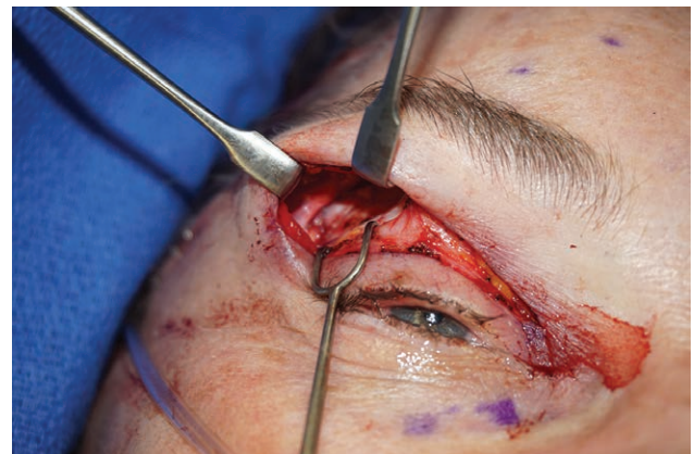
Fig. 4. Lateral upper blepharoplasty dissection. Subperiosteal dissection is performed and the lateral orbital thickening is released. The interfascial fat pad should be visualized from the lateral blepharoplasty incision to confirm continuity of the temporal and blepharoplasty dissection planes.

Via the lateral aspect of the blepharoplasty incision, the lateral superior orbital rim periosteum is incised. Dissection proceeds in the subperiosteal plane and the lateral orbital thickening is released just cephalad to the level of the lateral canthal tendon. The interfascial fat pad should be visualized—confirming continuity of the temporal and upper blepharoplasty dissection planes (Fig. 4). Dissection then proceeds superomedially to fully release the orbital ligament and supraorbital rim ligamentous adhesions, thus creating a continuous subperiosteal plane allowing full mobility of the brow (Fig. 5). Once the desired lifting effect is achieved, two to three 3–0 polydioxanone (PDS) sutures are used to secure the posterior superficial temporal fascia (ie, galea) to the anterior periosteal and superficial temporal fascia layer. The skin flap marked for