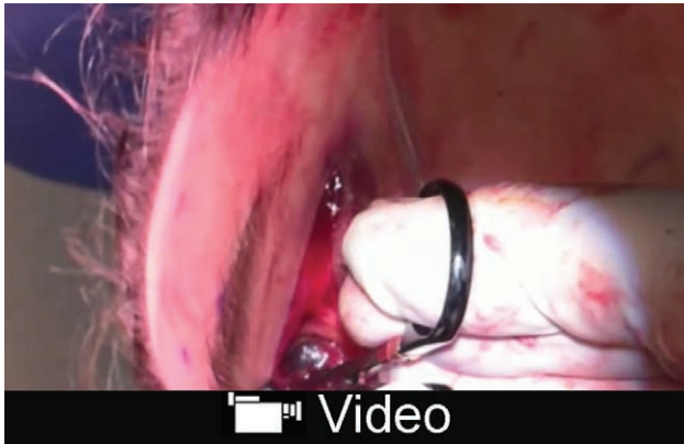
Video graphic 2. See video, Supplemental Digital Content 2, which displays a simplified lateral brow lift procedure. This video is available in the “Related Videos” section of the Full-Text article on PRS-GlobalOpen.com or available at http://links.lww.com/PRSGO/B97 .

cent-shaped area of anticipated skin excision. The long axis of the marking is made parallel to the lateral brow to maximize the vector of lift. The width of the area of temple tissue excision is tailored to degree of brow ptosis, approximately in a 4:1 ratio (width of tissue excision to expected lateral brow lift effect).