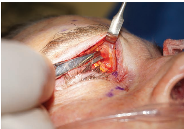
Fig. 2. Corrugator muscle is identified over the medial brow in the suborbicularis oculi plane. Care is taken to identify and protect the supratrochlear and supraorbital nerves and vessels. The corrugator is then cauterized with bipolar cautery and sharply divided.

The lateral temporal incision is made down to the temporalis fascia along the posterior line of the marked crescent. Dissection proceeds above the deep temporal fascia in the area caudal to the superior temporal septum. Cephalad to the superior temporal septum dissection proceeds inferomedially in the subperiosteal plane toward the lateral superior orbital rim. These 2 dissection planes are joined by fully releasing the superior temporal septum (ie, zone of adhesion). Just posterior to the lateral orbital rim, the deep layer of the deep temporal fascia is incised, exposing the interfascial fat pad (Fig. 3). The entire hemiforehead is then widely undermined in the subperiosteal plane to allow for proper redraping. To maximize lift, the orbital ligament, the supraorbital rim ligamentous adhe-