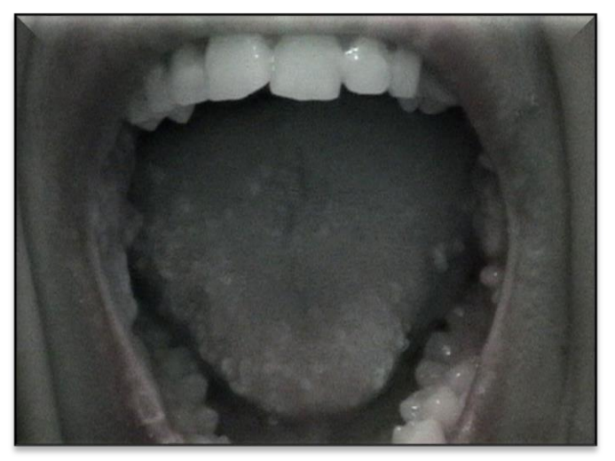
Figure 1. Disseminated warts on oral cavity in a patient with MHC class II deficiency.

In this study, oral candidiasis was the most common infection in patients with CID, frequently associated with broncho-pulmonary infections (61 cases, 66.30%), digestive infections (56 cases, 60.9%), ear, nose, and throat infections (23 cases, 25%) and persistent diarrhea resulting in failure to thrive (39 cases, 42.4%). Mucocutaneous lesions due to candida were more frequently oral, whitish,