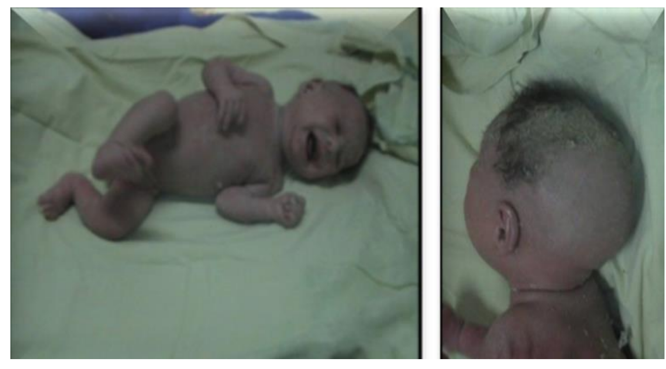
Figures 3 and 4. Erythroderma with alopecia in a patient with Omenn syndrome.