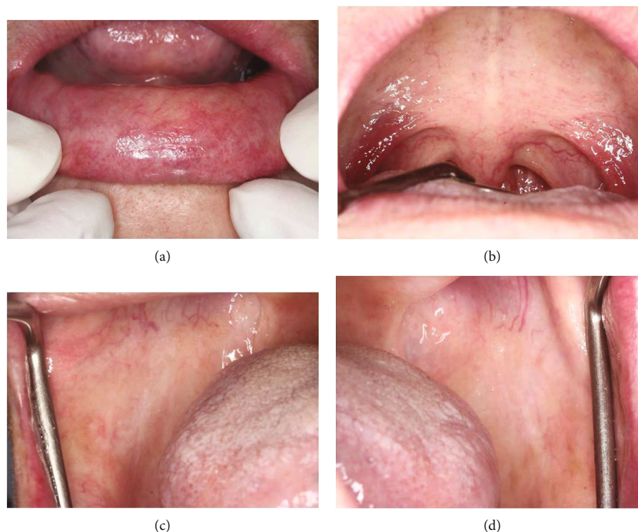
FIGURE 4: Clinical illustration after 8-month treatment period; complete resolution of superficial mucoceles at the lower labial mucosa (a) and the soft palate (b). Remission of OLP lesions at the bilateral buccal mucosa (c, d).