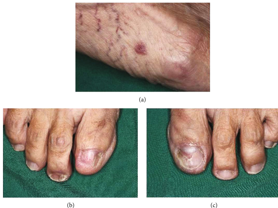
FIGURE 2: Extraoral examination revealed a polygonal purple papule with white striation on the dorsal surface of the foot (a) and dystrophic toenails (b, c).