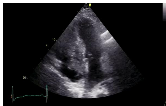
Figure 1 Transthoracic echocardiogram revealed poorly separated from the interventricular septum mass, which completely obliterated the right ventricular cavity and extended into the right atrium. TTE 4-chamber view showing right atrium mass. RA, right atrium; RV, right ventricle; LA, left atrium; LV, left ventricle. White arrow shows intra-ventricular mass.

A transthoracic echocardiogram (TTE) for dyspnoea evaluation revealed a non-compressing circumferential pericardial effusion and a