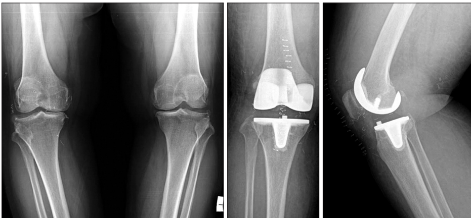
Fig. 1. Preoperative anteroposterior radiographs of both knees in a 61-year-old woman showing severe tricompartmental osteoarthritis of both knees (right>left). Immediate postoperative anteroposterior radiograph following total knee replacement of the right knee and lateral radiograph showing a well-aligned right knee with adequate cementing of components without any residual deformity.