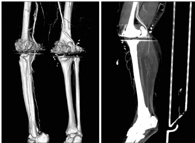
Fig. 2. Computed tomographic angiography of the right lower limb. A large pseudoaneurysm of the right popliteal artery. The popliteal artery was occluded distal to the pseudoaneurysm and was reconstituted at the tibioperoneal trunk. No significant stenosis was noted in both crural arteries with good distal runoff.

parameters. On auscultation, there were no signs of adventitious sounds such as crepitus or rhonchi. Local examination revealed swelling over the entire right lower limb with painful restriction of motion of the right knee. In addition, we also noted swelling over the popliteal region, which was non pulsatile and without any signs of auscultation bruit. The postoperative status of the wound was good with no fresh discharge. On distal neurovascular examination, the right lower limb was found to be warm, and the pulsation of both the dorsalis pedis artery and posterior tibial artery was found to be normal. Neurologically, the ankle dorsiflexors were found to have motor grade 1, and there was a sensory deficit noted in the common peroneal nerve distribution. Based on these findings, a provisional diagnosis of common peroneal nerve palsy was made and a foot drop splint was applied