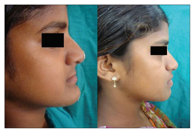
Figure 10: Post-operative extra-oral lateral profile view showing improved nasolabial angle, mentolabial sulcus and inter jaw relationship

A patient with hypophosphatasia, presenting with partial anodontia and highly resorbed ridges with severely constricted maxillary arch, was treated successfully with cast partial denture in mandibular arch, and an overdenture for the maxillary arch. The occlusion was restored to a functional form, and the patient was highly satisfied with the aaesthetic