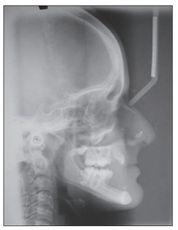
Figure 4: Lateral cephalogram showing prognathic relation of the mandibular to the maxilla of the patient in the case report