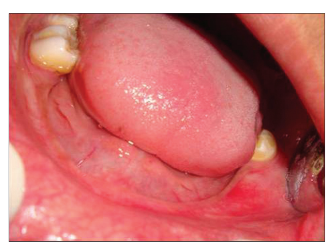
Figure 2: Severely atrophied alveolar ridge and partial anodontia of the patient in the case report

The patient was tested for ALP levels, which were found to be 3 times lower than the normal values confirming the diagnosis of hypophosphatasia. Long bone radiographs appeared normal. Treatment for this patient was planned keeping in mind her psychological aspect, young age and severe bone loss with partial anodontia. It was carried out step by step in various phases: rehabilitating the periodontal condition with non-surgical intervention that included complete oral prophylaxis