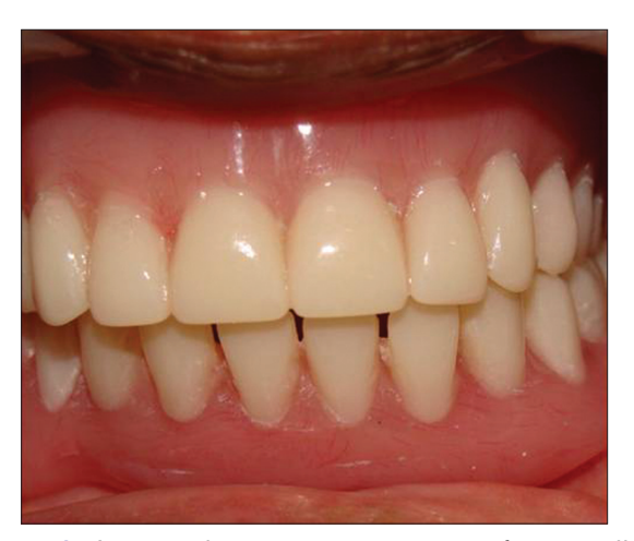
Figure 8: Intra-oral post-operative view after maxillary overdenture and mandibular cast partial denture insertion in the mouth of the patient in the case report