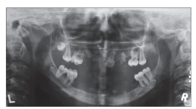
Figure 3: Orthopantomogram showing horizontally impacted third molars and reduced bone density with severe bone atrophy in both maxilla and mandible of the patient in the case report

molar, and mandibular right first and second molar. Patient did not have any established occlusion with poor aesthetics [Figures 1-2]. Orthopantomogram (OPG) and a Lateral Cephalogram were taken. OPG revealed severe alveolar bone loss with enlarged pulp chambers and stunted root growth of molars. There were horizontally impacted third molars and reduced bone density with severe bone atrophy in both maxilla and mandible. [Figure 3] On examining the Lateral Cephalogram, a prognathic relation of mandible with maxilla was observed [Figure 4].