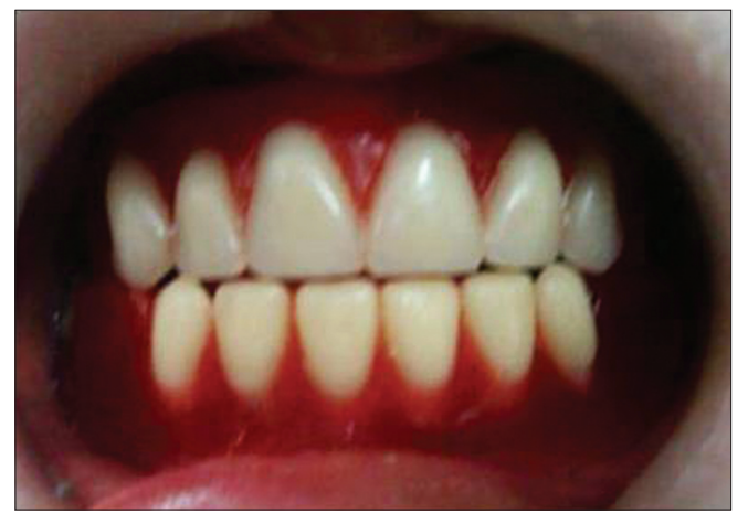
Figure 5: Tentative aesthetic anterior try-in of the patient in the case report

After the pre-treatment procedures, the tentative aesthetic anterior try-in was performed [Figure 5] and improved aesthetics with adequate lip fullness and improved inter arch