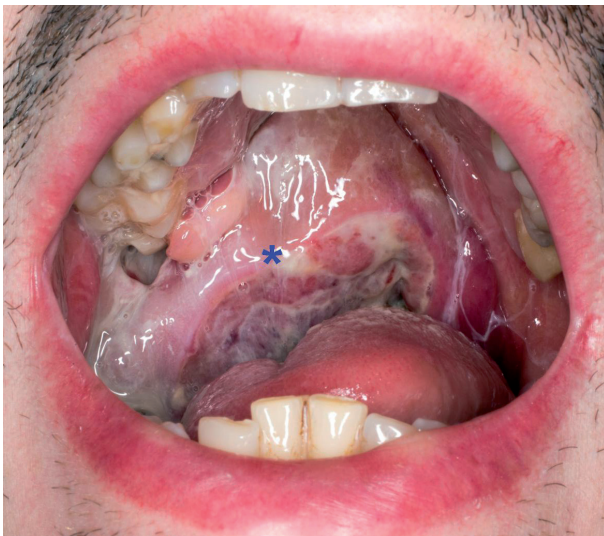
Figure 1. Patient's oropharynx showing a large ulcerating mass involving the right tonsillar region and the soft palate (blue asterisk)

A 24-year-old hispanic man presented with progressive severe dysphagia unresponsive to repeated cycles of antibiotics prescribed by his physician. Inspection of the oropharynx showed a large ulcerating mass involving the right tonsillar region and the soft palate (Figure 1, blue asterisk). An incisional biopsy under local anesthesia revealed the presence of inflammatory tissue. After no improvement of symptoms after 48 hours of intravenous broad-spectrum antibiotherapy, oral biopsy was repeated under general anesthesia. Histological exam documented a malignant population of monomorphic B-cells, strongly positive to CD20, CD10, and C79a. Macrophages interspersed with lymphoid cells gave a “starry sky” histologic pattern that is typical of BL. T-cell markers were negative. In situ hybridization showed EBV positivity. A total body 18-fluorodesossiglucose ( ^{18}\text{F} -FDG) PET/CT scan was performed, which showed a high uptake of ^{18}\text{F} -FDG in the right oropharyngeal region with a \text{SUV}_{\text{max}}=26.6 , corresponding to the primary tumor (Figure 2, arrowhead). Additional secondary low-density lesions were described in several sites of skeleton (Figure 2, continuous arrows) and right adrenal gland (Figure 2, dotted arrow), with a \text{SUV}_{\text{max}} ranging