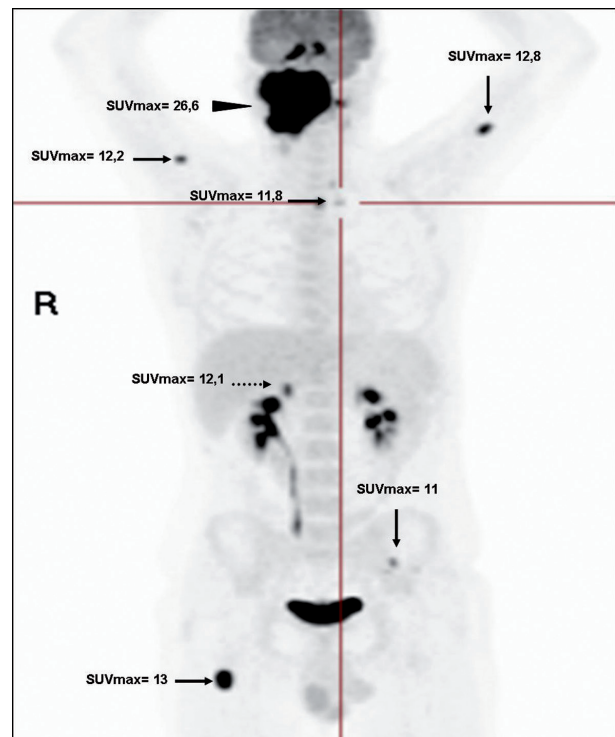
Figure 2. Patient's ^{18}\text{F} -FDG PET scan showing a high uptake in the right oropharyngeal region, corresponding to the primary tumor (arrowhead); additional secondary low-density lesions are visible in several sites of skeleton (continuous arrows), and in the right adrenal gland (dotted arrow)

from 11 to 13. Spinal puncture showed no involvement of the central nervous system. Lymphoma was classified as stage IV according to the revised Lugano staging system. Serologic investigations documented an HIV infection, with a CD4 T-lymphocyte count of 589 cells/ \mu\text{L} (23%). HIV infection was then staged as C3 AIDS, according to the U.S. Centers for Disease Control and Prevention (CDC) classification system. Venereal disease research laboratory (VDRL) test and Treponema pallidum Hemoagglutination Assay (TPHA) were positive for syphilis infection. The patient then underwent antineoplastic therapy with two cycles of R-CODOX-M regimen, alternating with 2 cycles of R-IVAC regimen, associated with eight intrathecal methotrexate/cytarabine injections. Concomitant combined antiretroviral therapy with tenofovir/emtricitabine plus raltegravir for HIV infection was started, obtaining a rapid virologic suppression. For syphilis infection, the patient underwent penicil-