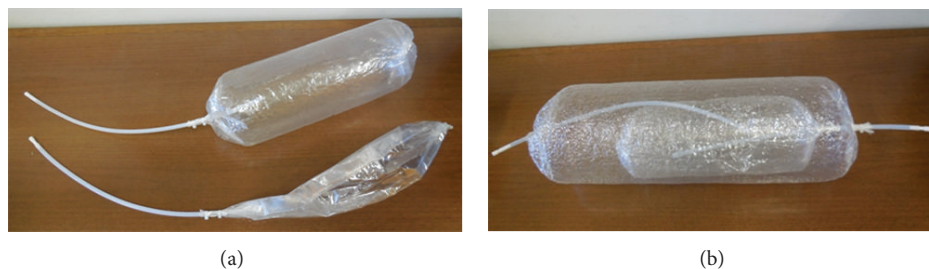
FIGURE 1: Nalophan bags: (a) single bag and (b) double bags.

column (CP 7591-PoraPlot Amines, length 25 m, internal diameter 0.32 mm, and film thickness 10 \mu\text{m} ). The oven temperature follows a three-step program: 100°C for 12 minutes, from 100°C to 200°C with a rate of 8°C/min, and 200°C for 5 minutes. The carrier gas was helium with a constant flow of 3 mL/min (a pressure of 1.21 atm and a mean velocity of 53 cm/s). The gaseous mixture inside the bags was analysed with the GC, equipped with a TCD detector, at specific time intervals, in order to evaluate the variations of \text{NH}_3 concentration (ppm) over time.