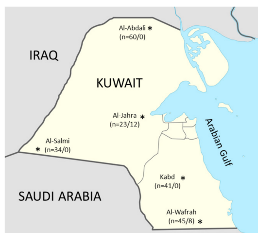
Figure 1. Map of the state of Kuwait showing the five districts holding the majority of sheep herds in the country, and n (non-vaccinated/vaccinated) is the number of tested herds.

non-vaccinated herds (60 herds from Al-Abdali, 45 herds from AL-Wafrah, 41 herds from Kabd, 34 herds from Al-Salmi, and 23 herds from Al-Jahra), and 20 herds (12 herds from Al-Jahra and eight from Al-Wafrah) with a history of vaccination with B. melitensis Revi.1 vaccine were sampled (Table 1). Herds were vaccinated during a test-and-slaughter program of the veterinary authorities of Kuwait. Samples have been collected from vaccinated herds one year after vaccination to avoid the potential cross-reactions produced by antibodies induced by the vaccine. All animals (100%) in the selected visited herds were sampled and examined.