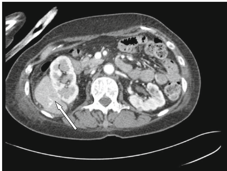
Figure 1 Initial CT showing retroperitoneal mass compressing on the right kidney.

In this case, we presented a patient who was treated with a combination of Gemcitabine and Paclitaxel, following diagnosis of metastatic LMS. Our use of these two compounds resulted in a far better survival outcome than that which has been reported in the literature. We suspect that positive hormonal receptor expression by cells of the LMS may have contributed to the outcome we observed. The association, which has been recognized in cases of