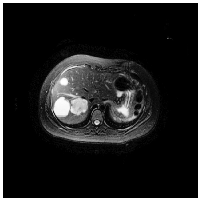
Fig. 3. Post resection with liver metastasis.

In March of 2012, she was submitted to caudal body pancreatectomy, splenectomy, segmental colectomy at 15 cm of the transverse, colo-coloanastomosis and resection of 18 regional lymph nodes (Fig. 2). It should be emphasized that intraoperatively, the surgeon observed macroscopically tumoration of approximately 8 cm occupying the body and tail of the pancreas, adhering to the transverse mesocolon, posterior wall of the stomach, third