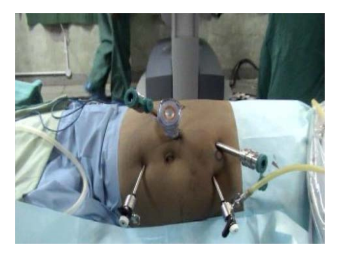
Fig. 1 Port position for right robotic pyelolithotomy after creation of the pneumoperitoneum

The procedure is initiated, using a 30^{\circ} downward facing lens, by a limited mobilization of the colon overlying the kidney and renal pelvis. The ureter is located and traced