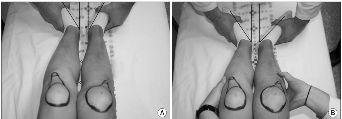
Fig. 1. Thigh-foot angle was measured with an external rotation stress applied to the tibia at both 30^\circ and 90^\circ of knee flexion. Before applying the torque, a neutral force (A) and anterior force (B) was applied to the tibia.

For the diagnosis, the posterior and varus stress radiographs and MRI images were observed in the radiological examination and a posterior drawer test was performed to assess the PCL injury in the physical examination. Posterior displacement of the tibia was divided into 3 grades according to the difference between the affected and unaffected side: grade I indicated 3-5 mm of a side-to-side difference; grade II, 6-10 mm; and grade III, \geq 11 mm. Six patients belonged to grade II and 10 patients to grade III. The posterolateral injuries were categorized according to the varus instability and rotatory instability. Varus instability was classified into 3 grades based on the difference in the lateral joint space opening between the injured leg and the other: grade I was defined as < 5 mm of a side-to-side difference; grade II as a 5-10 mm difference with a firm end point; and grade III as a more than 10 mm difference without a firm end point. No side-to-side difference was observed in 7 knees. There were 8 grade I knees and 1 grade II knee. Based on our encounters with cases where external rotation and varus instability were not in proportion, the external rotatory instability was assessed with respect to external rotation only: grade I was considered as less than a 5^\circ increase in