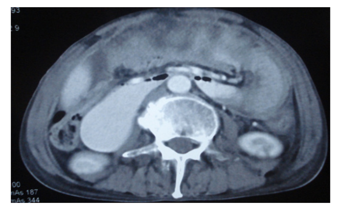
Figure 3. Bottle gourd sign (dilated duodenal loops) with entrapped jejunal loops in a membranous cocoon.