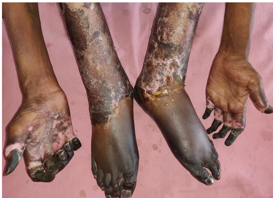
Fig. 1. Gangrenous changes involving distal extremities of hands and feet associated with focal hemorrhagic blisters, erosions and desquamation.

On admission, he was febrile (37.8 °C) with tachycardia (pulse rate: 110/min). His blood pressure was 104/60 mmHg and