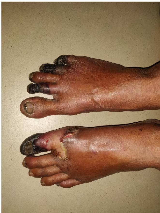
Fig. 2. Dry gangrene with areas of ulceration involving the toes of both feet.

The comparison between the presentation, clinical features, laboratory parameters and outcome of the two cases has been outlined in Table 1.