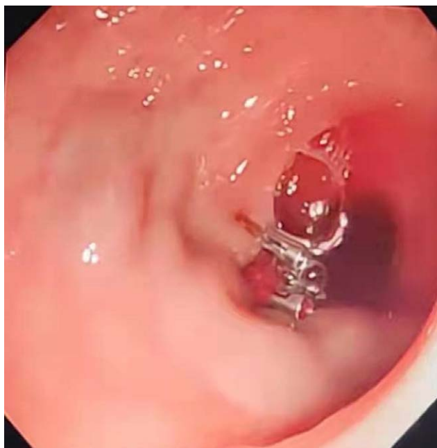
Figure 2. The ruptured vein mass was clipped with a titanium clip under colonoscopy.

serum albumin 23.04 g/L, total bilirubin 16.8 \mu\text{mol/L} , and prothrombin time 14.8 seconds. Her Child-Pugh class was B. After admission, the patient developed hemorrhagic shock again, with hemodynamic instability (HR 140 beats/min, BP 80/30 mmHg). No obvious varicose veins and bleeding were found on gastroscopy. Emergency colonoscopy found that a varicose vein mass in the sigmoid colon wall 30 cm from the anus was ruptured and bleeding. The ruptured vein mass was immediately clipped by titanium clip for hemostasis treatment (Fig. 2).