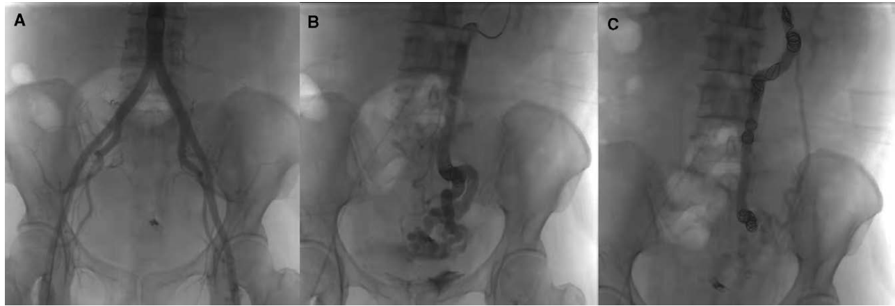
Figure 3. (A) Aortography showed no arteriovenous fistula; (B) percutaneous transhepatic inferior mesenteric venography revealed the presence of a varicose mass of sigmoid colon vein; and (C) slow blood flow was observed after embolization.

was found to be as high as 50%. Given the risk of liver failure and hepatic encephalopathy after TIPS and the patient's refusal to undergo TIPS, we chose angiographic embolization for treatment.