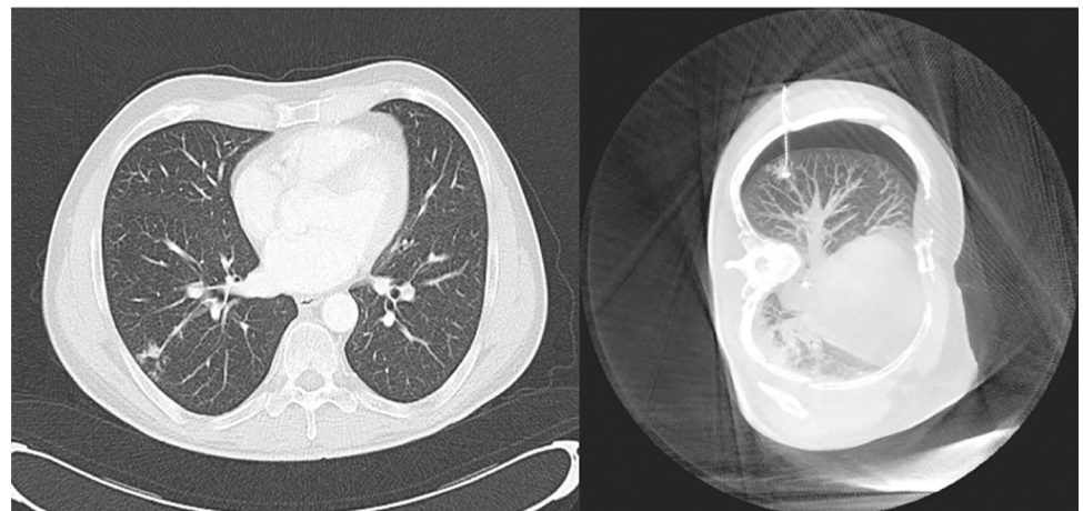
Fig 3. Suspicious right lower lobe lesion which turned out to be tuberculosis.

Due to the high imaging quality and the low radiation exposure, the indication for low-dose CT scans has expanded both to the screening of primary lung cancer and to the follow-up of other malignancies. This will certainly lead to a further increase in the detection rate of small, nonspecific pulmonary lesions. The main problem resulting is the potential overtreatment