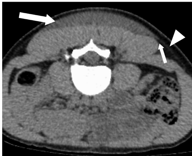
Fig. 1 – Axial abdominal CT image showing fluid collection (long arrow) as a low-dense, symmetrically localized area along the erector spinae muscle. Note a small gap (short arrow) between the superficial fascia (arrowhead) and erector spinae muscle.

interventional therapy, and infectious infiltration [3]. We describe a case of a 6-year-old boy with PLSE observed on CT and MRI. The patient had IgA vasculitis (Henoch-Schönlein purpura) causing subcutaneous edema, but PLSE is markedly rare in patients with IgA vasculitis. The present case report discusses the clinical significance of these radiographic findings.