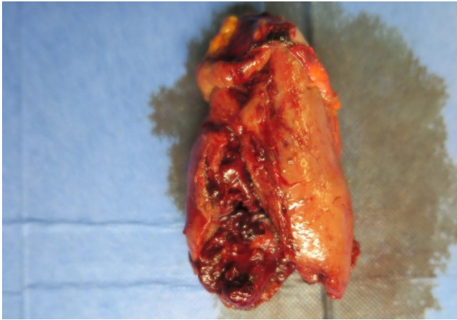
Figure 3 Resected transplanted kidney specimen.

deeply lacerated into the renal pelvis and was almost transected (figure 3), which was of grade IV injury. We clamped the hilum of the injured kidney, but there was continuous venous bleeding in the vicinity. We explored the bleeding site and found an approximately 2 cm laceration of the right external iliac vein, which was anastomosed to the injured transplanted kidney, located on the dorsal side of the right external iliac artery. There was no injury on the right internal iliac artery, which was anastomosed to the injured transplanted kidney. Hemostasis of the external iliac vein was difficult, and the patient's blood pressure fell again despite blood transfusion. REBOA was partially inflated for 37 minutes until hemostasis was achieved. Inflating the balloon increased blood pressure, decreased bleeding, and improved visibility in the surgical field. The transplanted kidney was resected, and the laceration of the right external iliac vein was sutured. The bleeding was stopped. Her postoperative course was good and there were no complications, but the patient needed dialysis again.