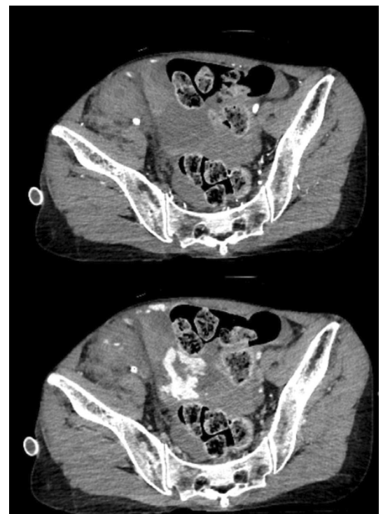
Figure 2 Enhanced computed tomography showing extravasation of the contrast medium in the pelvis. (Top: arterial phase, Bottom:parenchymal phase).

© Author(s) (or their employer(s)) 2023. Re-use permitted under CC BY-NC. No commercial re-use. See rights and permissions. Published by BMJ.