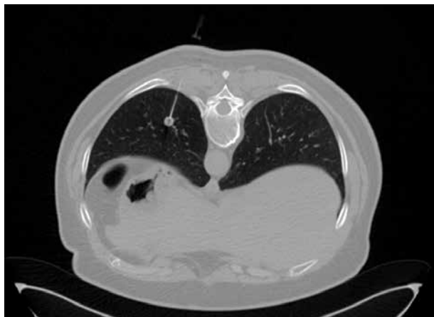
Figure 1. An example of lung tumour biopsy – typical carcinoid was confirmed