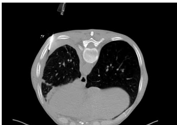
Figure 5. An example of pleural lesion biopsy – pathological evaluation confirmed mesothelioma