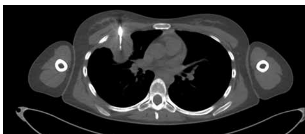
Figure 4. An example of chest wall tumour biopsy – Ewing sarcoma was confirmed