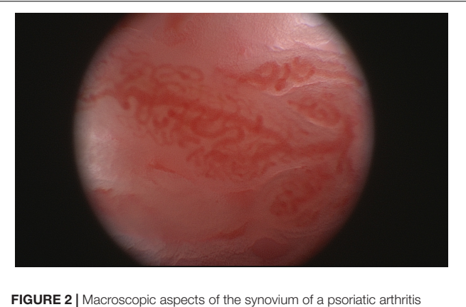
FIGURE 2 | Macroscopic aspects of the synovium of a psoriatic arthritis patient, showing a tortuous and bushy vascularization.

particular, compared with RA. Marked synovial vascularity is a relevant finding in the synovial tissue of most PsA patients.