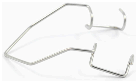
Figure 1 B1 – speculum Barraquer odous with open blade.

The speculum used in all cases was as follows: open-edged wire – Barraquer (speculum Barraquer odous with open blade [B1]; Odous, Belo Horizonte, Brazil; Figure 1); threaded with open blade – Lieberman forceps (speculum Lieberman forceps with open blade [B2]; Katena, Denville, NJ, USA), with 21 mm aperture (Figure 2); wired with solid blade – Barraquer (speculum Barraquer odous with