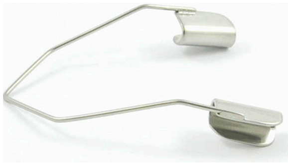
Figure 3 B3 – speculum Barraquer odous with closed blade.

result was verified for each variable, being excluded from the ranking when the values were statistically significant (Table 3). In this way, we took the sum of the ranking for each variable and multiplied by the number of times it was statistically significant, thus obtaining a general ranking where the lowest value equals the best blepharostat (Table 4).