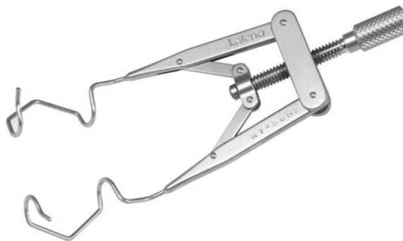
Figure 2 B2 – speculum Lieberman forceps with open blade.

Statistical significance was tested using Student's t -test and p -value for the analysis of the data collected. To infer the conclusion about which would be the best blepharostat, an absolute numerical methodology was applied, using a summary of significant p -values for each variable and apparatus (Table 1) and a table of means for each variable and apparatus (Table 2). Then, a ranking of the points of the lowest variations was performed when compared to the examination without speculum. After that, a numerical